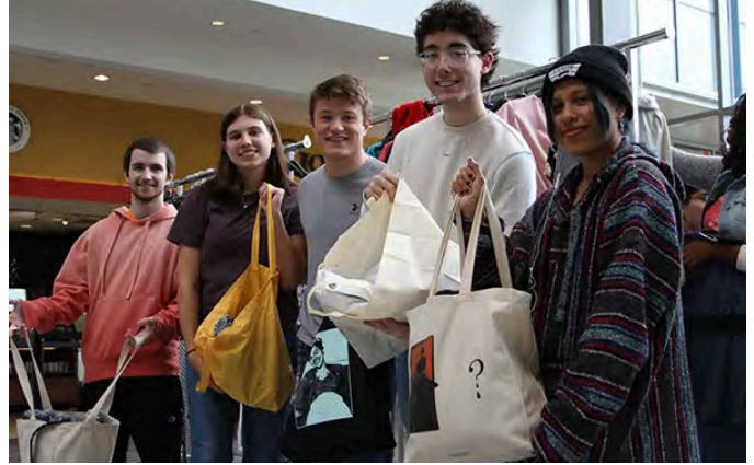
The Student Society for Sustainability (SSS) held "Thrift Day", and donated clothes became free to the public.